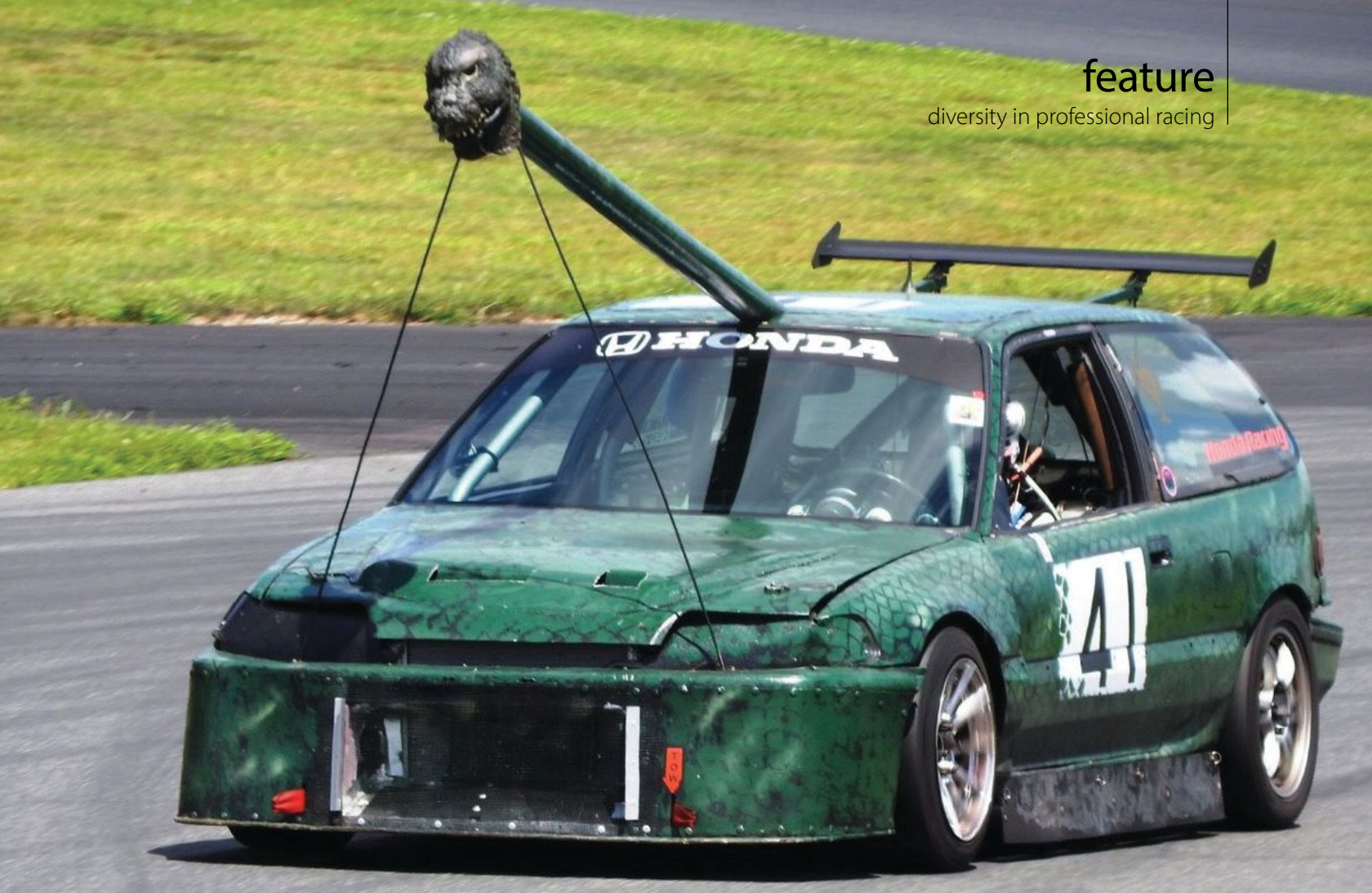
Decorating the cars is part of the fun of the 24 Hours of LeMons races.

getting sponsorships is difficult, even for men. Despite this challenge, she likes breaking barriers and proving people wrong.